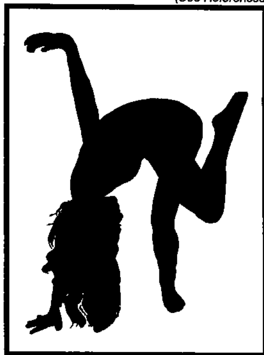
Silhougraph of Eleanor King in Transformations rendered from 1955 photograph by Howard Whitlatch (Plett 1988, p. 19)